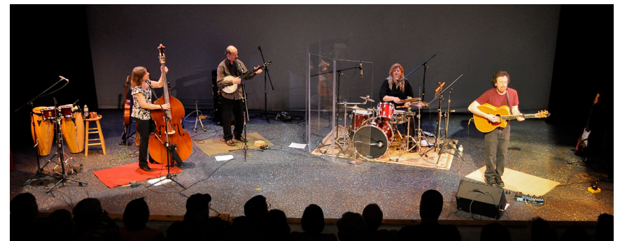
Fig. 1 - Typical stage setup

Andrew McKnight cell 540/729-3021 (all non-tech questions/issues)